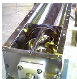
Vertical Screw Conveyor