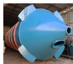
Vertical Sand Storage Silo