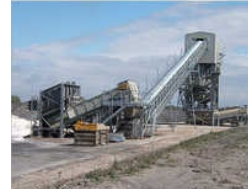
Industrial Material Handling Plant