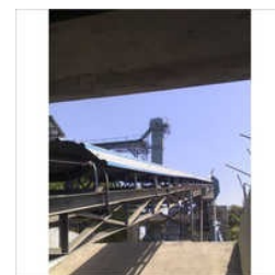
FUEL HANDLING SYSTEM