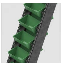
Chain Type Bucket Elevator