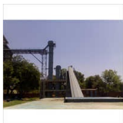
100 TONS CAPACITY COAL HANDLING PLANT

1.2 Ton Capacity Vibrating Screen, 100 Tons Capacity Coal Handling Plant, 210 V Lump Crusher, 5000 kg Capacity Ice Crusher, Bagasse Handling Plant, Belt Bucket Elevator, Belt Conveyor, Boiler Fuel Handling Plant, Cattle Feed Screw Conveyor, Cement Screw Conveyor, Cement Silo, Cement Storage Silo, Chain Conveyor, Chain Type Bucket Elevator, Coal Handling System, etc.