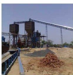
Industrial Coal Screening Plant