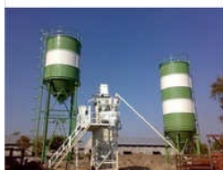
Industrial Cement Silo