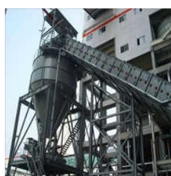
Boiler Fuel Handling Plant