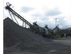
Industrial Coal Crushing Plant