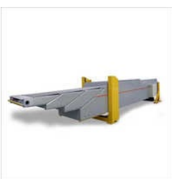
Industrial Telescopic Conveyor