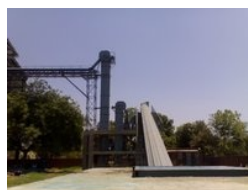
Coal Handling System