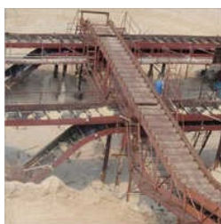
Bagasse Handling Plant