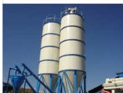
Cement Storage Silo