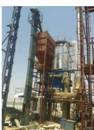
Industrial Bucket Elevator