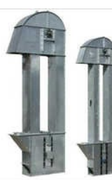
Belt Bucket Elevator